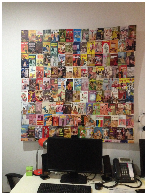
Above: DiVo phone room nostalgia Below: The DiVo team at Pride 2013

In September 2015, three years after registering as a charity and following 31 years' service to the diverse populations of Queensland, the organisation changed its name to better reflect the breadth of individuals we serve. Diverse Voices was born.