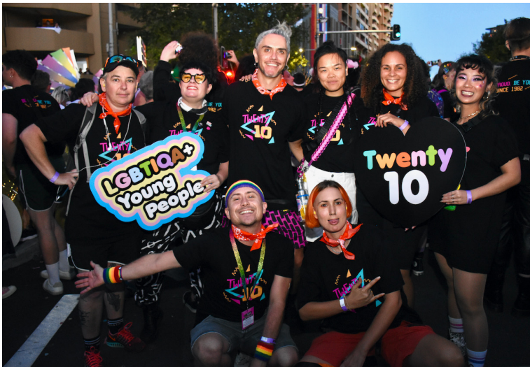
Twenty10 crew at Sydney Mardi Gras, 2023.