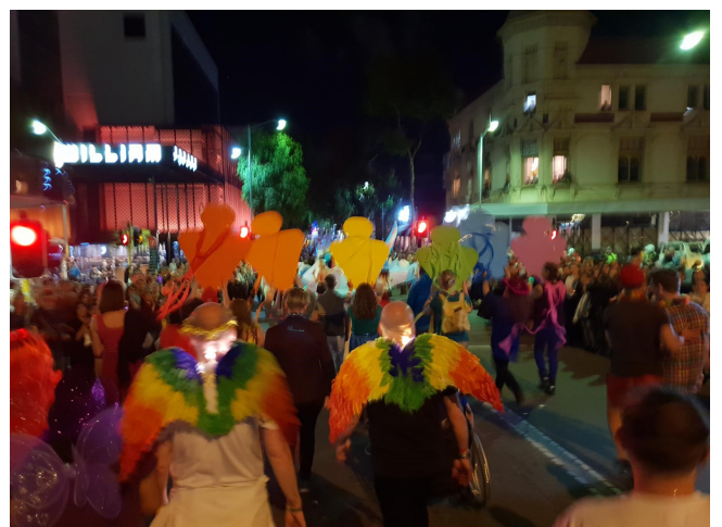
Perth Pride Parade, 2018

Living Proud offers a number of LGBTIQ+ awareness and ally-ship training options for professionals, organisations and corporates including face to face half day and full day training and e-learning modules, Queer and Accessible project, Mental Health commission grants and QLife all in order to improve accessibility for LGBTI people. Living Proud also has a successful history of running funded projects, often in partnership with other community groups.